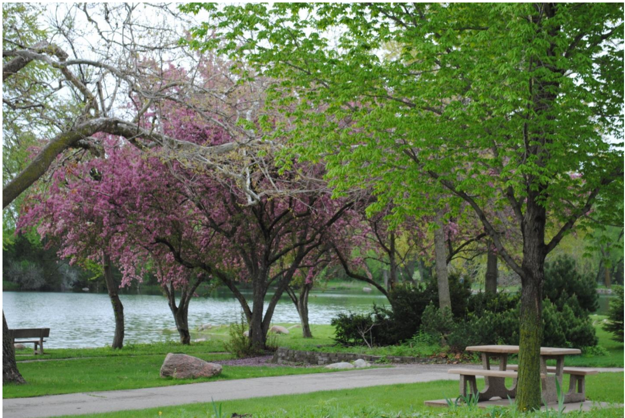
at Spring Lake Park

Cherokee Chamber of Commerce | 201 West Main Street | Cherokee, IA 51012 Phone: 712.225.6414 | email: info@cherokeeiowachamber.com www.cherokeeiowa.com Updated 11/1/2019